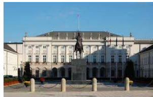
Head of State